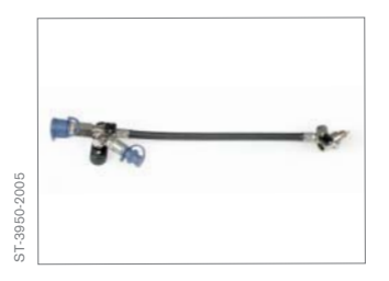
Second Medium Pressure Combined Connector