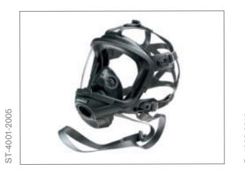
FPS 7000 Facemask