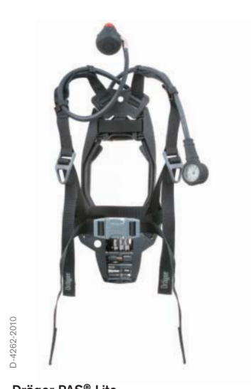
Dräger PAS® Lite

Incorporating new materials that are shaped and formed to provide maximum comfort at both the shoulders and the waist, the carrying system has been developed to reduce back strain, stress and fatigue. The innovative harness design ensures an excellent weight distribution at the shoulders. The inclusion of durable rubber coated fabric provides excellent wearing comfort and chemical resistance, whilst also performing well during the flame engulfment test in line with EN137 Type 2.