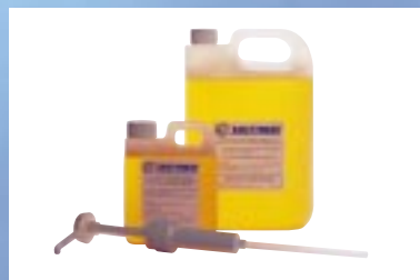
Safety Wash 1 litre Dispenser (order code:- 338 0164) 1 litre Refill (order code:- 338 0165) 5 litre Dispenser (order code:- 338 0166) 5 litre Refill (order code:- 338 0167)