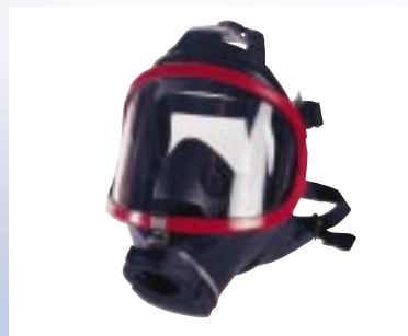
Panorama Nova Face Mask (order code - R59024)