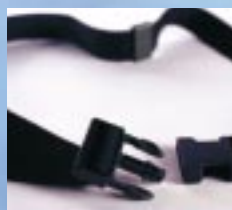
Waistbelt (order code:- 335 0396)