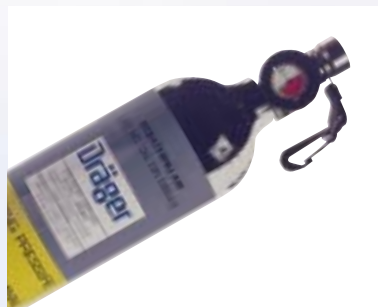
10 Minutes Spare Cylinder with blank (order code:- 335 0148) 10 Minutes Spare Cylinder with blank (DIN) (order code:- 335 0409) 15 Minutes Spare Cylinder with blank (order code:- 335 0156)