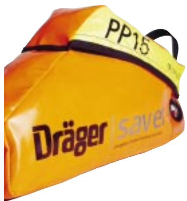
Saver PP15 (order code:- 335 0405)