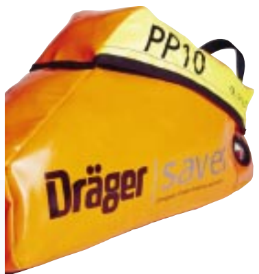
Saver PP10 (order code:- 335 0334) Saver PP10 with DIN cylinder (order code:- 335 0408)