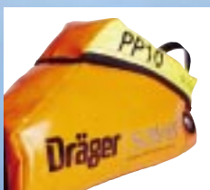
Anti-Static Bag 10mins (order code:- 335 0425) Anti Static Bag 15mins (order code:- 335 0648)