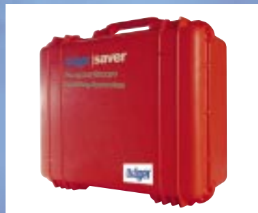
Storage Cabinets (order code:- 335 0424) Wall Mounting Kit (order code:- 335 0431)