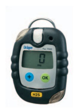
Dräger Pac 7000: High performance and unlimited use.

Small and robust, ergonomic and intuitive, economic and powerful – the Dräger Pac 7000 is tailor-made for personal monitoring at the workplace. This innovative single gas detector is equipped with a wide range of functions and is suitable for many different applications in day-to-day industrial settings. The detector is an impressive instrument, offering a high level of reliability and rapid warning against harmful concentrations of CO, CO<sub>2</sub>, Cl<sub>2</sub>, HCN, H<sub>2</sub>S, NH<sub>3</sub>, NO<sub>2</sub>, O<sub>2</sub>, PH<sub>3</sub>, SO<sub>2</sub>.