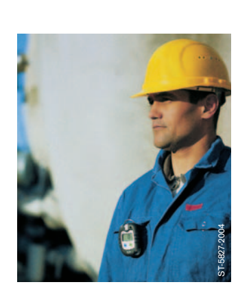
Dräger Pac 7000: High level of wearing comfort.