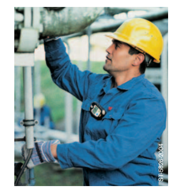
Dräger Pac 7000: Reliable in daily use.

For further information, please visit: www.draeger-safety.com/pac