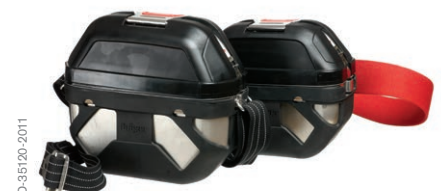
Dräger Oxy 3000/6000 Oxygen self-rescuer with mouthpiece, nose clip, protective goggles and shoulder strap, without abrasion protection