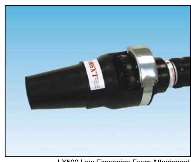
LX500 Low Expansion Foam Attachment