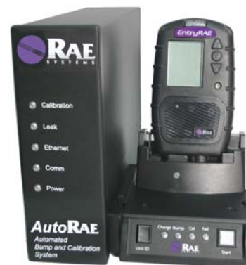
AutoRAE Docking Station